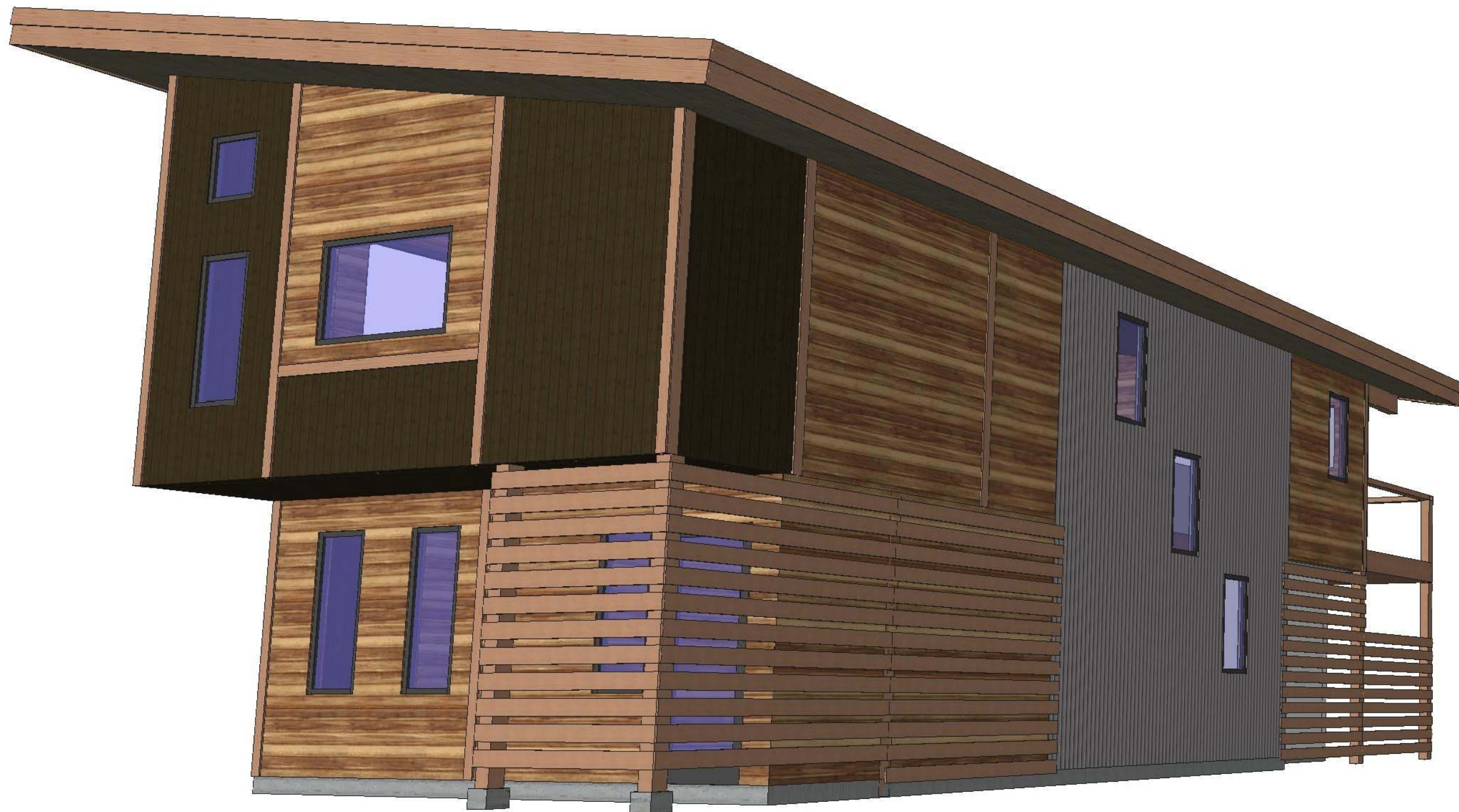
1 PERSPECTIVE VIEW ONE NTS