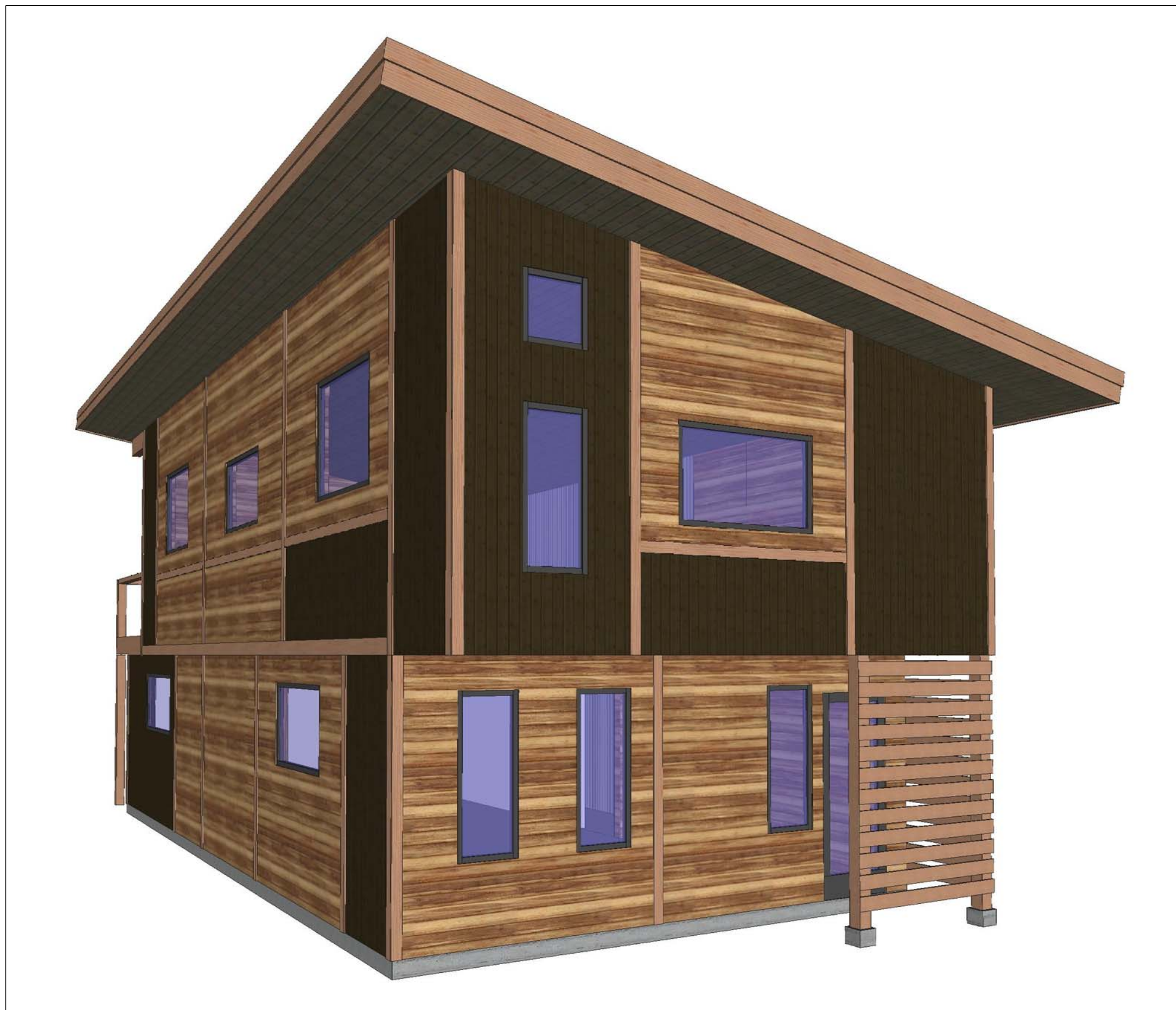
I PERSPECTIVE VIEW TWO NTS